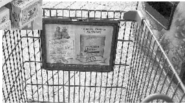
Shopping cart advertisement for Wal-Mart brand infant formula