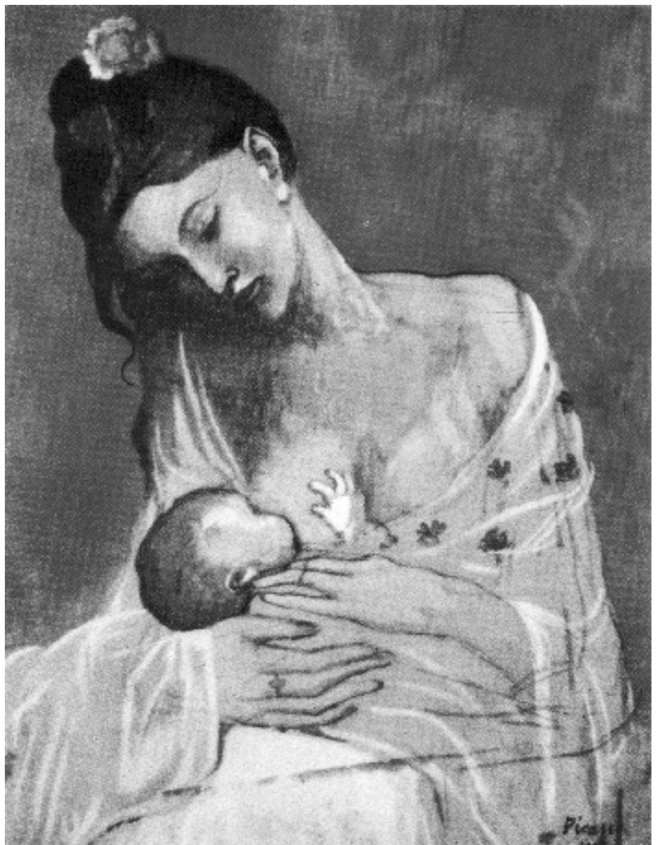
"Maternity" Pablo Picasso 1905

In conclusion, the Swedish findings show that newborns use their hands as well as their mouths to stimulate maternal oxytocin release and this may have significance for uterine contractions, milk production and mother-infant interaction. ❖