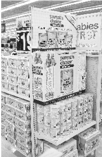
Wal-Mart brand infant formula display